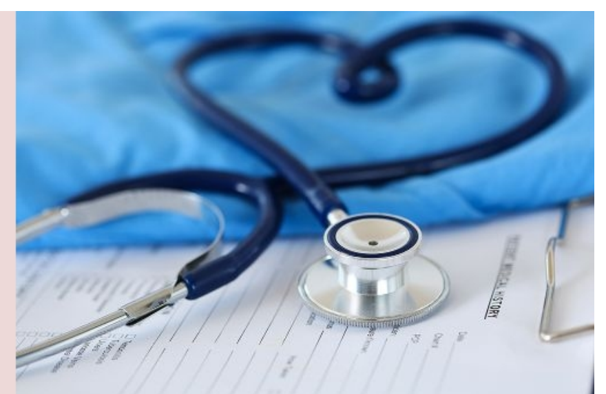
Wilat is a vii tuai Medicai Assistailt

https://s3.us-east-2.wasabisys.com/what-is-a-virtual-medical-assis tant/what-is-a-virtual-medical-assistant.html