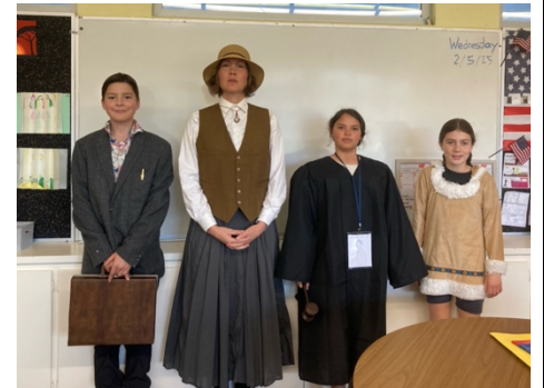
Dress like you're 100 years old, from 100 years ago, or 100 years in the future.