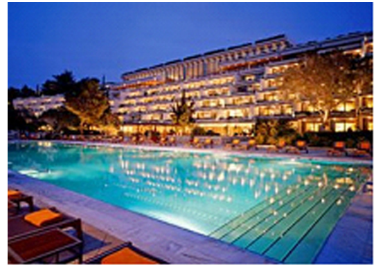
Astir Palace Hotel Resort Athens, Greece

For decades myriads of leaders from many international organizations have been meeting to discuss a world government with a central head. The latest occurred with the Bilderbergers' annual convention, which met May 17, 2009, at the Astir Palace Hotel Resort in Athens, Greece (the group began in 1954). Those meetings were so secret that they had hundreds of police, navy commandos, Coast Guard speed boats and F-16 fighter planes to guard the area.[3]