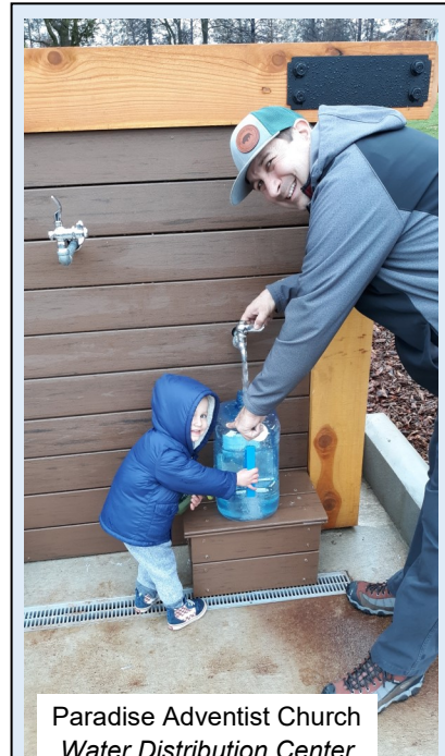
Paradise Adventist Church Water Distribution Center Dedication Sabbath, March 2