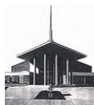
First Seventh-day Adventist Church of Tulsa