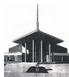
First Seventh-day Adventist Church of Tulsa