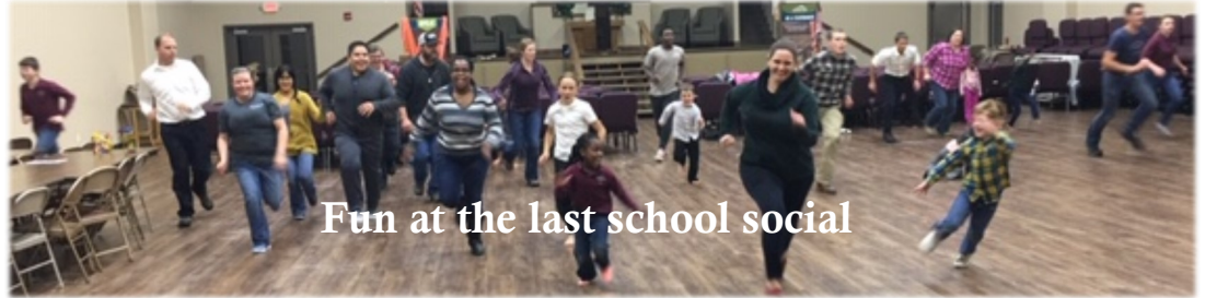
Fun at the last school social